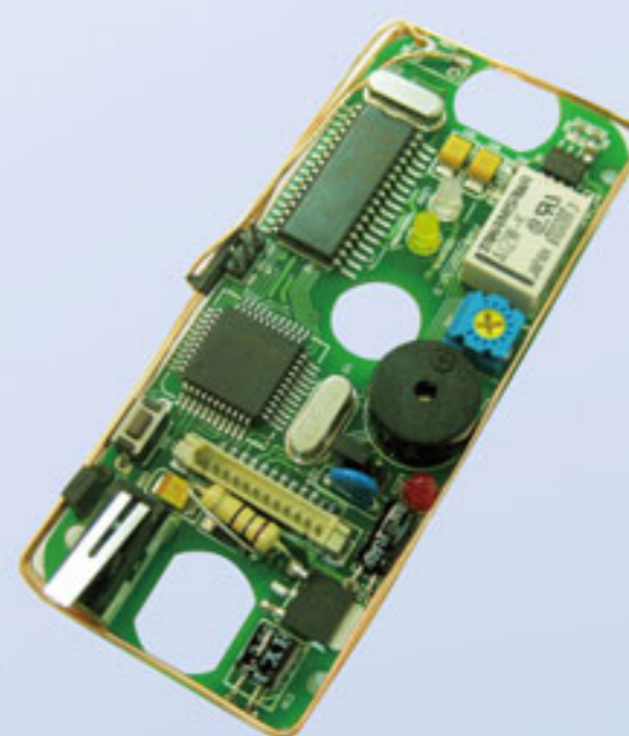
Mifare access control module board